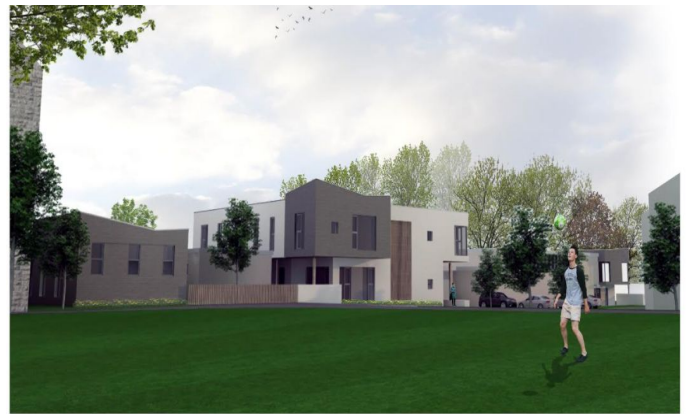
St. Macartan's College, Monaghan